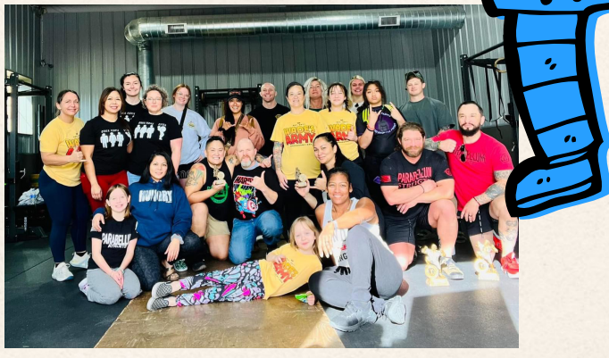
Parabellum Martial Arts & Strength - First Strongman Competition in the books! Bringing awareness to the community and exemplifying what it means to be STRONGER TOGETHER.