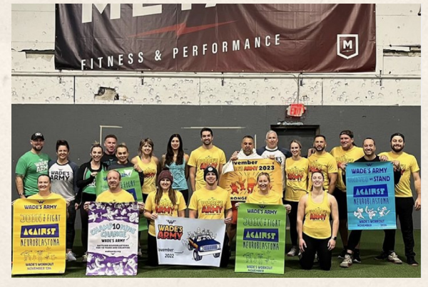
Team Ziegler - Battling Neuroblastoma by uniting the community.