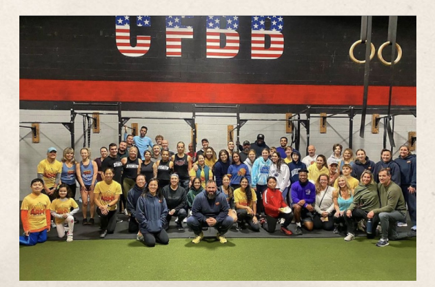
CFBB - Championing Change with a huge turnout bringing the community together for the Wade's Day workout with heart, food, fun, and a silent auction.